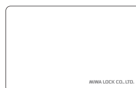
MIFARE Plus 1K (1kbyte)