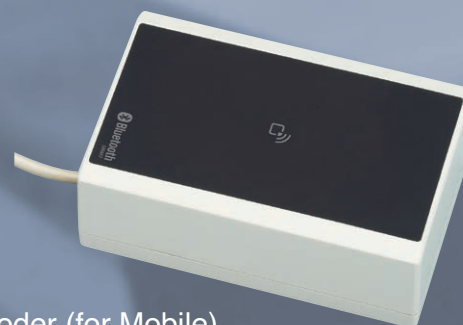
BLE encoder (for Mobile)