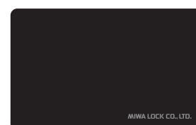
Mifare 4K (4kbyte)