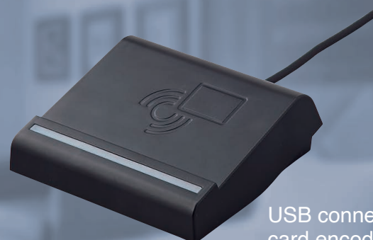
USB connected card encoder